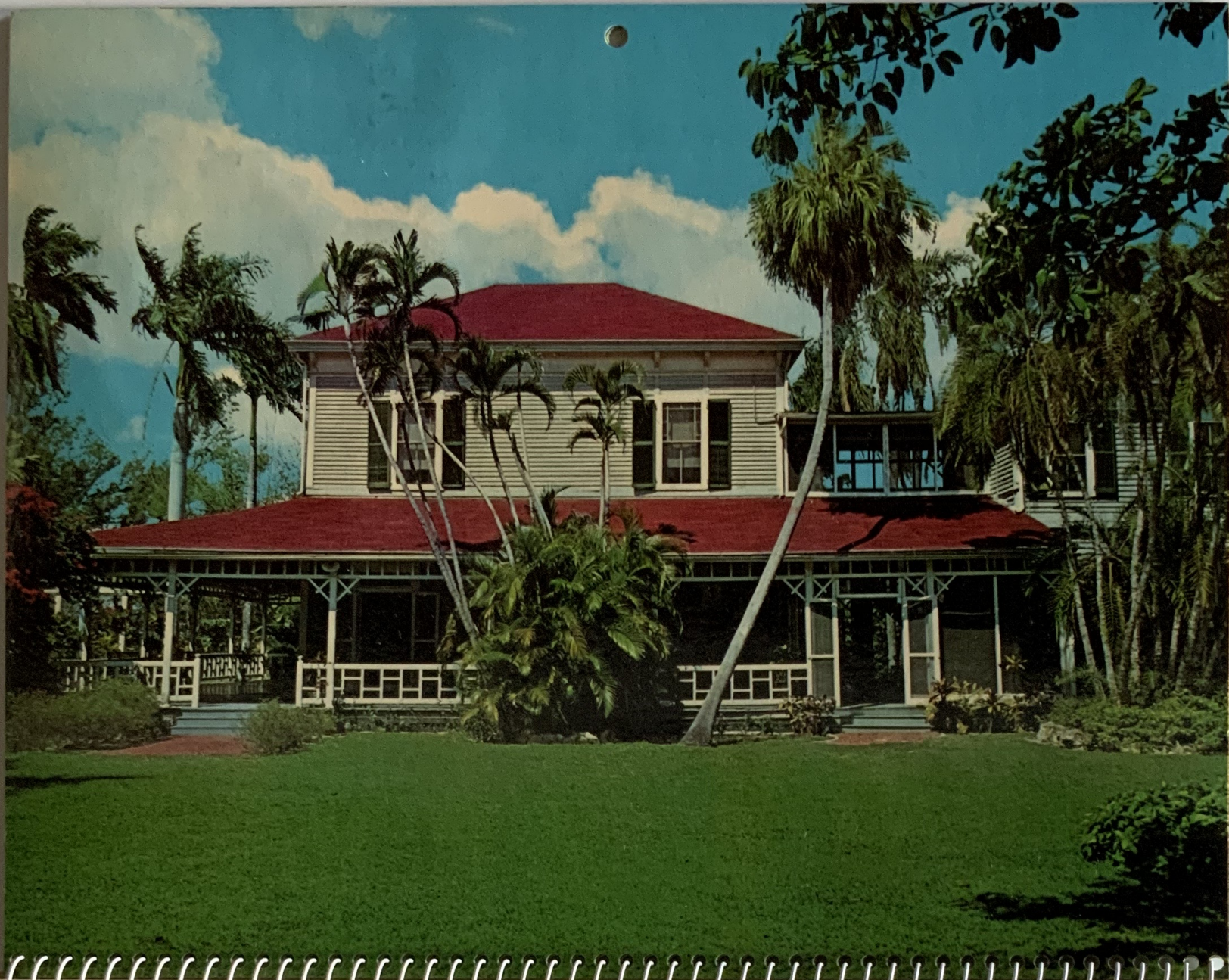
Edison Home: Ft. Myers, Florida