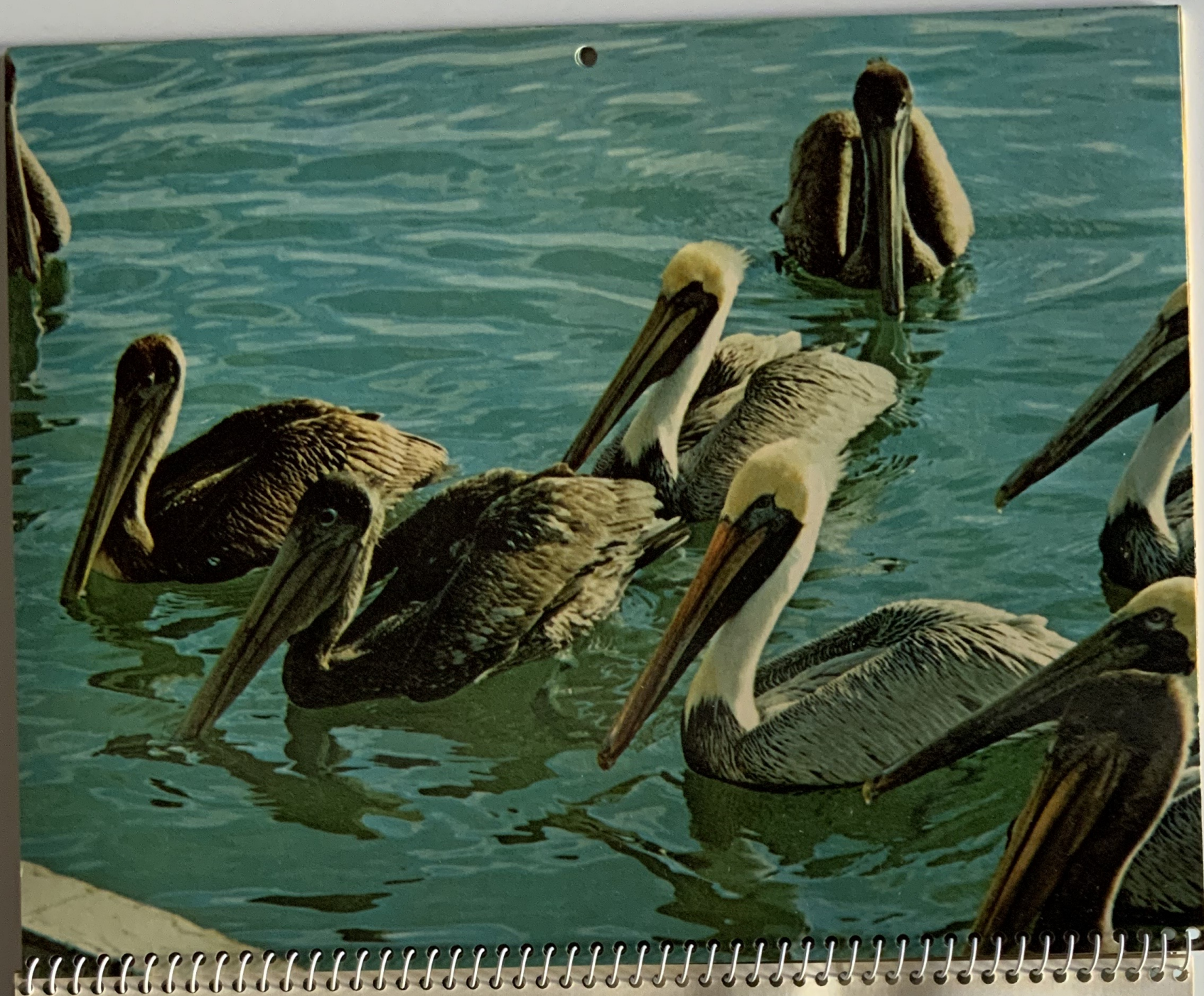
Pelicans waiting for a handout