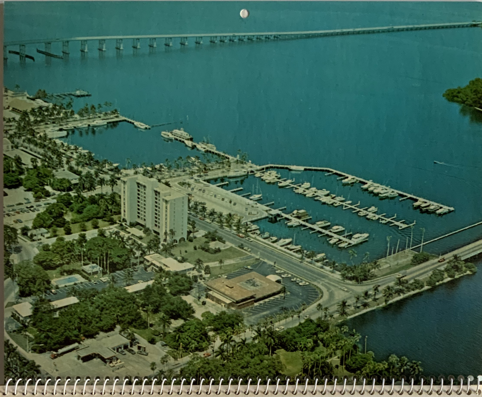
An aerial view of the yacht Basin and Twin Bridges over the Caloosahatchee River