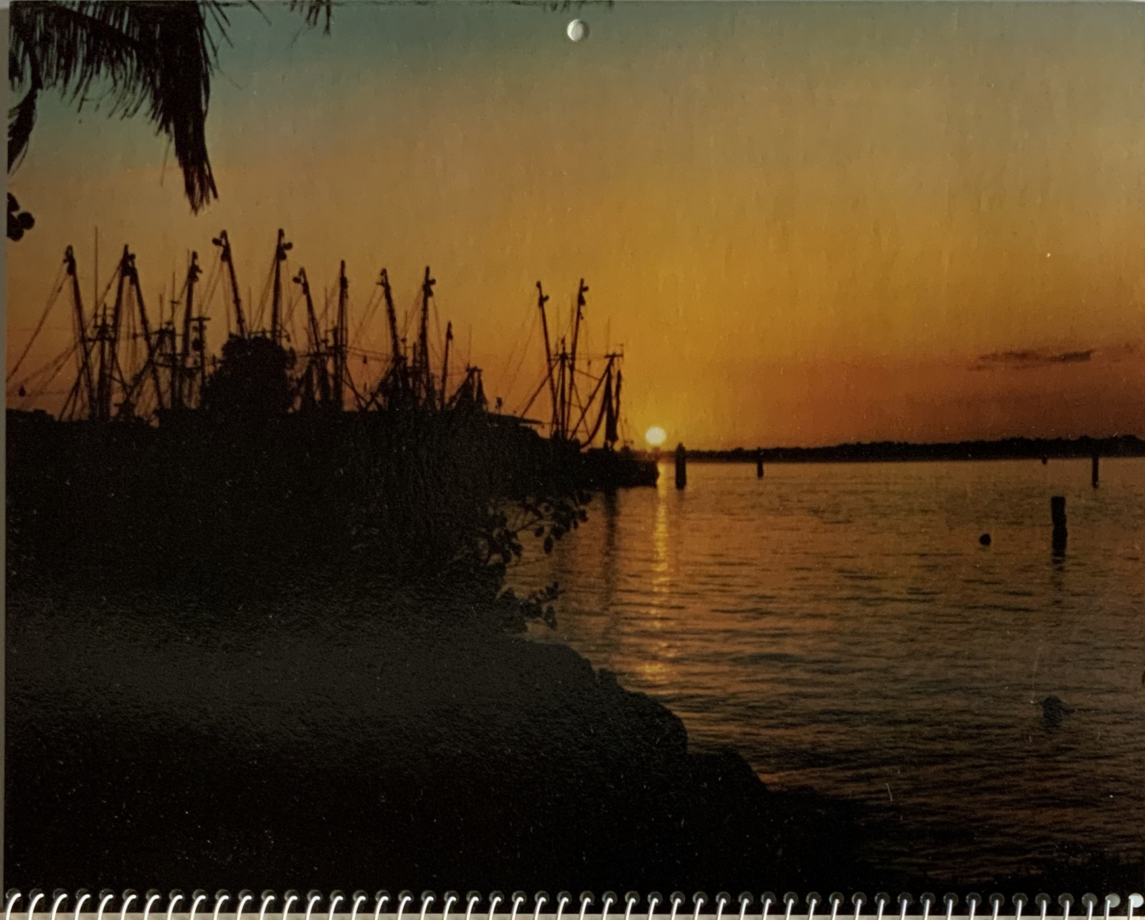
Shrimp Boats reposing in a beautiful Florida Sunset