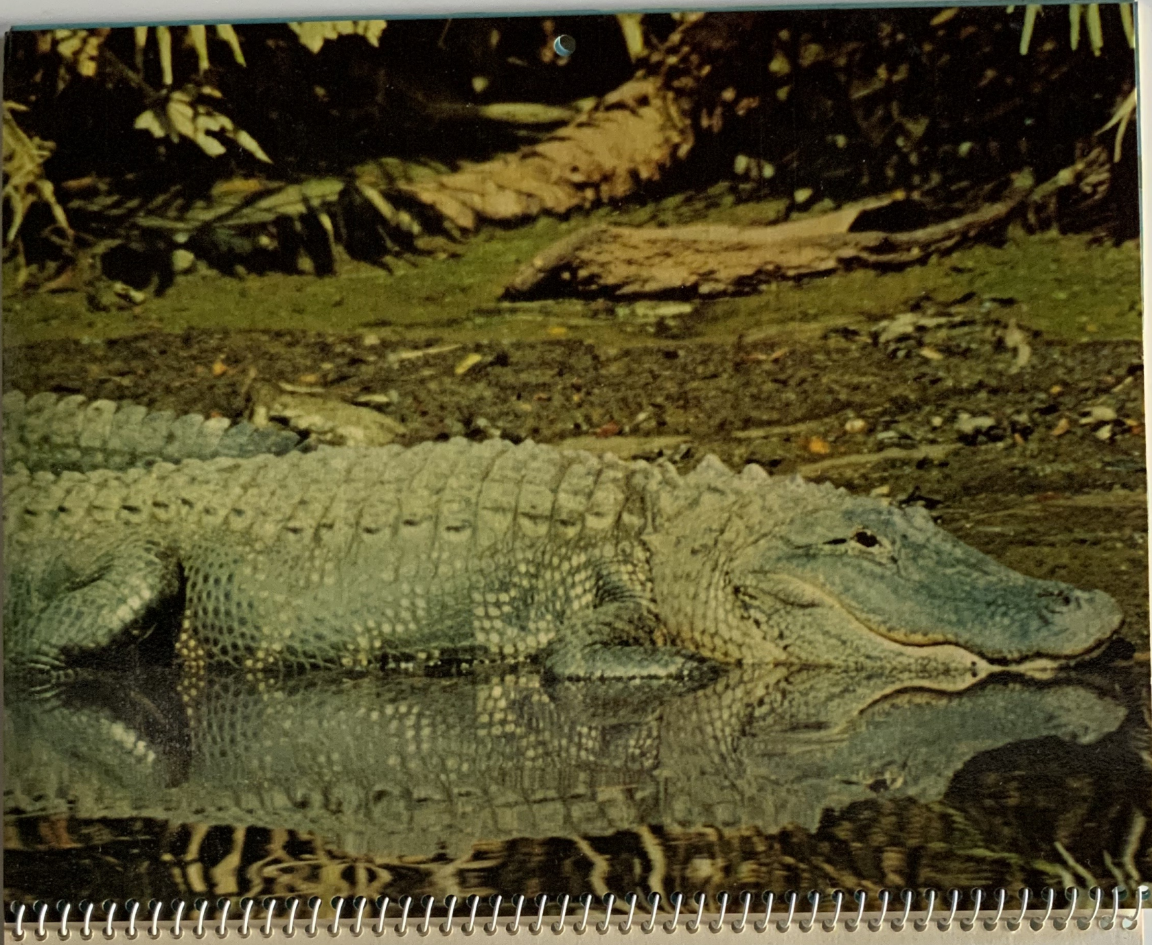
Alligator in Florida's sub-tropical wonderland