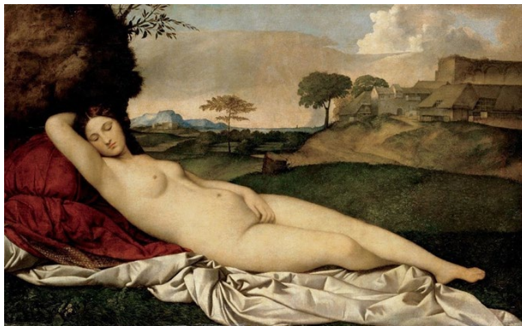
Giorgione, Sleeping Venus (ca. 1510)

The Venus of Urbino was in turn an outstanding example of Renaissance imitatio , or the creation of an original work from an existing model. See supra , p. 6. For Titian, the model was the Sleeping Venus of Giorgione, a master with whom Titian trained: