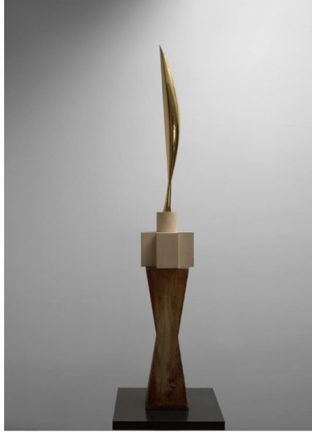
Constantin Brancusi, Bird in Space (1926)