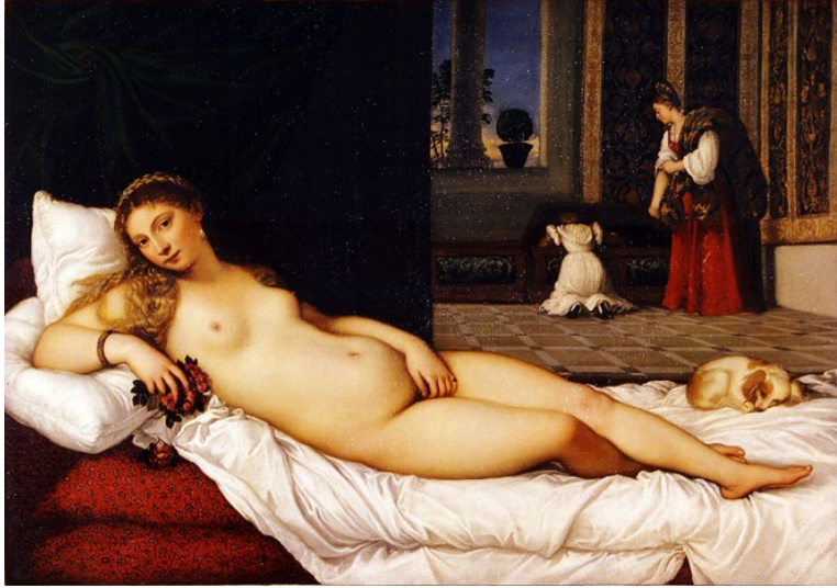
Titian, Venus of Urbino (ca. 1534)

The Venus of Urbino was in turn an outstanding example of Renaissance imitatio , or the creation of an original work from an existing model. See supra , p. 6. For Titian, the model was the Sleeping Venus of Giorgione, a master with whom Titian trained: