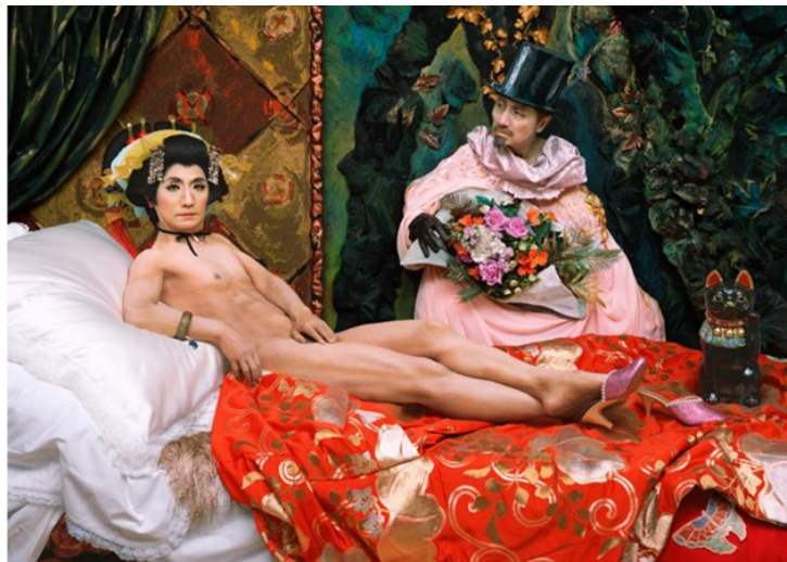
Yasumasa Morimura, Une Moderne Olympia (2018)

And by explicitly placing himself into a rendition of Manet's famous painting, Morimura—who knew that Manet was influenced by Japanese art 3 —was inserting himself into the history of Western art, and critiquing the way Japanese culture went largely unacknowledged in that history.