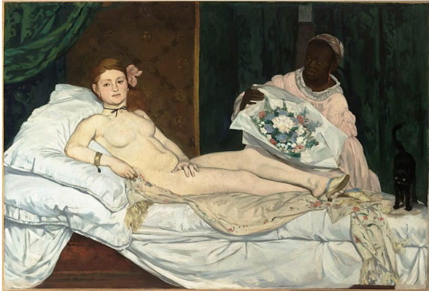
Édouard Manet, Olympia (1863)

The painting is now considered a foundational work of artistic modernism, but it created a furor at the Paris Salon of 1865. See Édouard Manet (1832–1883) , Metropolitan Museum of Art, https://www.metmuseum.org/toah/hd/mane/hd_mane.htm . The scandal was due not just to the painting's radically original sexual frankness, but also to its treatment of tradition. Manet's picture is at once part of a long tradition of imitation and an audacious burlesque of that tradition. Olympia references another famous nude of art history, the Renaissance master Titian's Venus of Urbino :