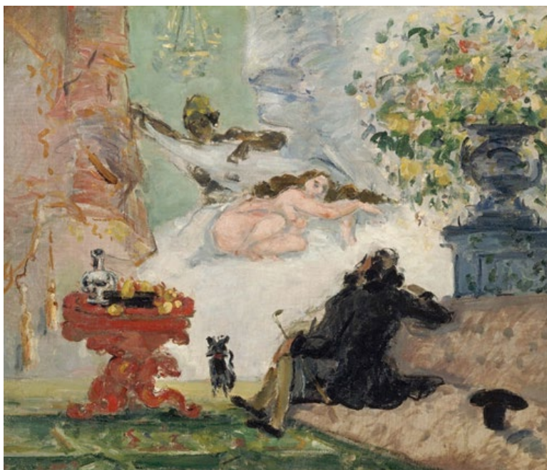
Paul Cézanne, Une Moderne Olympia (1873-1874)

2. Manet's unsentimental rejoinder to the Renaissance nude has itself inspired transformative responses. These began in Manet's lifetime, and included homages by Paul Cézanne, Manet's nineteenth-century contemporary. In his Une Moderne Olympia ( A Modern Olympia ), for example, Cézanne borrows the basic tableau of Olympia . Cézanne transforms the scene by rendering it in the frenzied brushwork characteristic of his early style, and by driving home the subject of prostitution (and the viewer's complicity in it) by inserting a lounging, admiring male patron in a frock coat, looking as if he had just stepped off the street and into the boudoir (or the artist's studio):