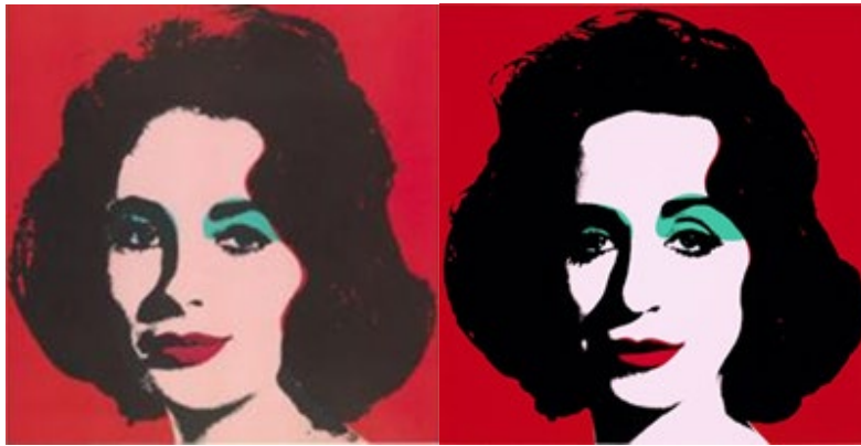
Left: Andy Warhol, Liz