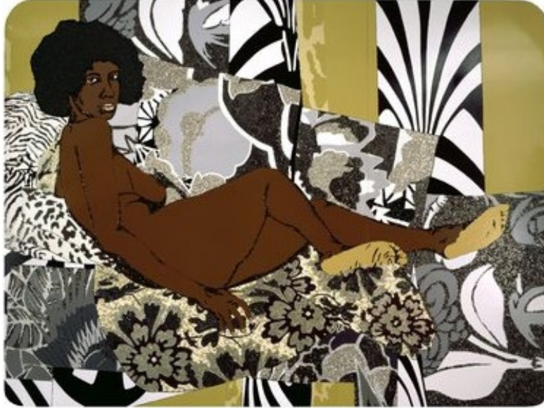
Mickalene Thomas, A Little Taste Outside of Love (2007), https://www.brooklynmuseum.org/open-collection/objects/5044 .

change on it, “oust[ing] the white European woman from the bed where she often lounges, attended by a black maidservant,” and installing the Black servant as the powerful object of desire at the center of the picture: