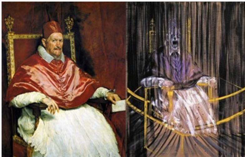
Left: Diego Velázquez, Portrait of Pope Innocent X (c. 1650)