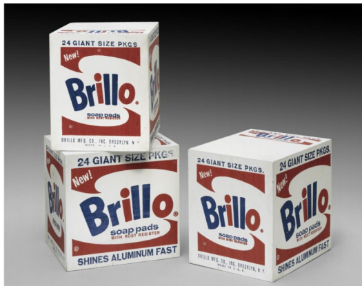
Andy Warhol, Brillo Boxes (1964)

This Court has therefore recognized that artistic use and reuse of a copyrighted work can plainly be transformative where the new artistic work changes the message and meaning of the original—from the mundane and commercial into an artistic commentary on consumer culture. That is precisely what Warhol did with the Prince Series—transforming realistic portrai-