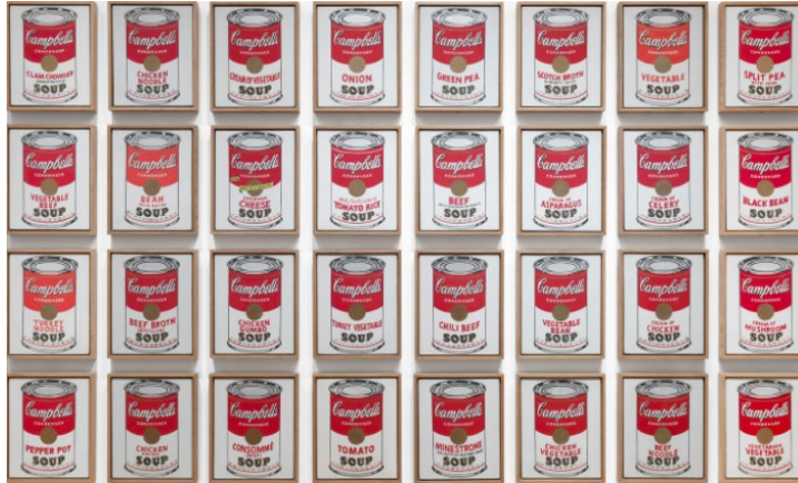
Andy Warhol, Campbell's Soup Cans (1962)

Campbell's Soup cans and life-sized replicas of Brillo boxes: