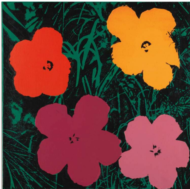
Elaine Sturtevant, Warhol's Flowers (1965)