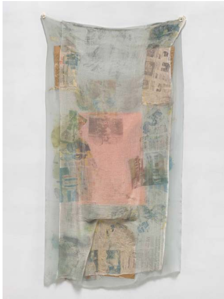
Robert Rauschenberg Untitled (Hoarfrost) , 1974 Solvent transfer on fabric and paper bags 80 1/2 x 42 1/2 x 2 inches (204.6 x 108 x 5 cm) Robert Rauschenberg Foundation RRF Registration# 74.015

DW: It must have been interesting for you to see the Hoarfrost at the Mnuchin Gallery then [Untitled ( Hoarfrost ), 1974 was included in Robert Rauschenberg: Exceptional Works, 1971–1999 , May 3–June 11, 2022].