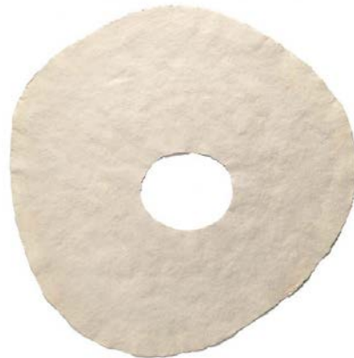
Robert Rauschenberg Page 2 (Pages) , 1974 Molded natural fiber handmade paper 22 inches (55.9 cm) diameter From an edition of 11, published by Gemini G.E.L., Los Angeles

Just very simple things. And also the stuff that he learned when he was in India. It was just a piece of cloth hung on the wall in a certain way and not much done to it. But I think it was too much for people. So then I think he looked back to start over again and then he did that, and then it came out that the ROCI tour came in and did all this, and then I saw the things with the—I think about the Gluts . That was my time here, seeing that stuff, and seeing the gasoline station