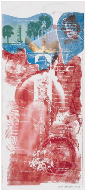
Robert Rauschenberg Sky Garden (Stoned Moon) , 1969 Lithograph and screenprint 89 1/4 x 42 inches (226.7 x 106.7 cm) From an edition of 35, published by Gemini G.E.L., Los Angeles