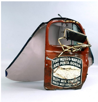
Robert Rauschenberg Carnival (Glut) , 1986 Assembled metal with mirror 50 x 73 x 43 inches (127 x 185.4 x 109.2 cm) Robert Rauschenberg Foundation

that was still down there. She said something along the lines of, “Well, you have always been a great sculptor.” [Laughs] In the nicest possible way. Bob was really, really pleased that she liked the beginnings of the Gluts or whatever they were. I don’t remember what the series was, but there was a lot of smashed up metal around in those days. She was really happy to see them and he was pleased that she liked them.