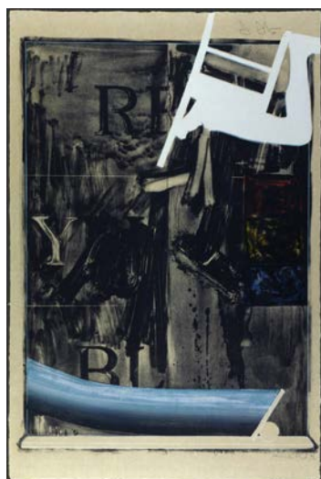
Jasper Johns Watchman , 1967 Lithograph 36 x 24 inches (91.4 x 61 cm) From an edition of 40, published by Universal Limited Art Editions, West Islip, New York

Just as another aside, I remember he had a copy of Watchman [1967] of Jasper's in a portfolio he showed us in the class and there was this thing with the litho white line around the whole of it. He said it was the one time that litho kind of failed them and that we probably should have silkscreened that little white line around it instead of just lithoing it because when you put litho white it always is transparent; hence those very pale white flags of Jasper's on black paper. They look like they're gray or more ghostly and that's not really how it is, but it's just how the litho ink reacts on the black paper.