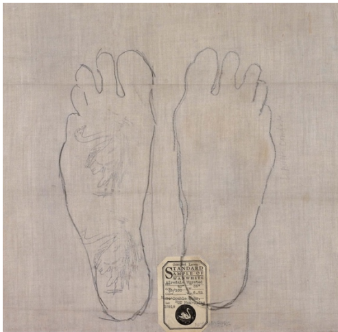
Robert Rauschenberg Lawn Combed , 1954 Pencil on found fabric 14 1/2 x 15 1/2 inches (36.8 x 39.4 cm) Robert Rauschenberg Foundation

Combed , 1954]. I remember seeing that and that was the thing that moved me the most. All of these things that I saw, but to see his two feet sketched out on this—I'm sure you can find a picture of it—that's the part—that's the thing—of all the stuff that was all around and that's the thing that moved me the most. That he could sit there and think that he could just trace his feet in that Bob hand and it would have a lot of magic to the whole thing.