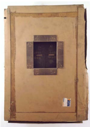
Robert Rauschenberg Aero Shield / Melons (Cardboard) , 1971 77 x 54 1/2 x 9 1/2 inches (195.6 x 138.4 x 24.1 cm) Robert Rauschenberg Foundation

I think a lot of people have been trying to walk in Bob's shoes or don't care about Bob's shoes, but they have to walk in his shoes and it's like he was everywhere. He was the artist of all of this— He started all of it. And he really informed the basis of a lot of things. Remember, he was the guy who made these cardboard works [ Cardboards , 1971–72], which are ravishing when you look at them now and nobody wanted them. They said, “Bob, what the fuck are you doing here? This is just garbage from whatever. What did you—? You've lost your—” And they were among the most sublime of his works. Just think about it. He could take all of that stuff. He started from those blueprints [ca. 1950], he did the White Paintings [1951] and the black paintings and all of that stuff, then he goes through the whole explosion of all the Combines [1954–64], and then he has the arc where he starts taking it back and taking it back, and you've got this piece of cardboard on the wall. You've got this piece of gauze with a string with a rock tied to it. And somehow or another it captures that little bit of magic that floats around in your life and it sits there and it takes your breath away.