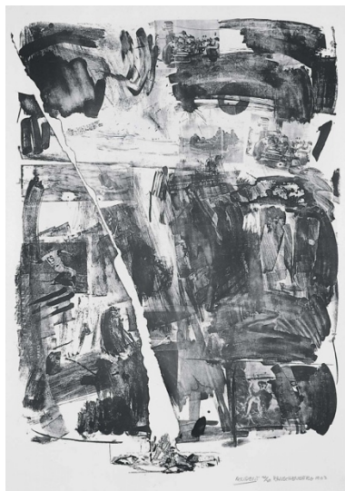
Robert Rauschenberg Accident , 1963 Lithograph 41 1/4 x 29 1/2 inches (104.8 x 74.9 cm) From an edition of 29, published by Universal Limited Art Editions, West Islip, New York