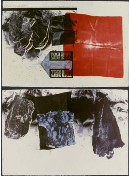
Robert Rauschenberg Treaty , 1974 Lithograph on two sheets of paper 54 1/8 x 40 3/16 inches (137.5 x 102.1 cm) From an edition of 31, published by Universal Limited Art Editions, West Islip, New York

Q: So why did he pick you? There are six or seven other people—