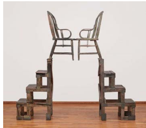
Robert Rauschenberg The Ancient Incident (Kabal American Zephyr) , 1981 Wood-and-metal stands with wood chairs 86 1/2 x 92 x 20 inches (219.7 x 233.7 x 50.8 cm) Robert Rauschenberg Foundation

I also think that that was an arc of Bob’s work. As with any artist, you kind of have moments where you’re rewiring yourself and going forward and basically by the time—I don’t remember quite how, they were simultaneous. I know there was all this stuff with ROCI and what I remember the most were the things made in Japan on the porcelain [note: ceramic], like the Napoleon [Bonaparte by Jacques-Louis David] [ Able Was I Ere I Saw Elba I and II (Japanese Recreational Claywork) , both 1985] and the [Jean-Auguste-Dominique] Ingres [ Drawing Room 4 (Japanese Recreational Claywork) , 1983] and the other things like this—and the [Edgar] Degas all going together [Untitled ( Japanese Recreational Claywork ), 1983, 83.037]. He said