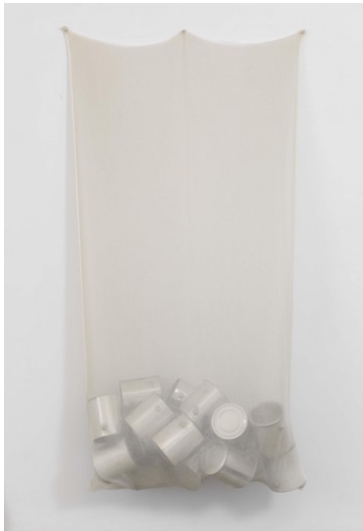
Robert Rauschenberg Coin (Jammer) , 1976 Sewn fabric and tin cans 89 x 43 x 19 inches (226.1 x 109.2 x 48.3 cm) Robert Rauschenberg Foundation

And then, of course, the cycle changes and he comes back to the period of what I think is Rodeo Palace [( Spread ), 1976], that whole period where he's looking back to look forward again. To me, some of the most beautiful work is the Jammers [1975–76] and that bag—which I don't remember the name of—the gauze bag that has all the empty paint cans in it that's tacked to the wall [ Coin (Jammer) , 1976]. Or the prints that he made out at Gemini that were rags put into the pulp pieces that were there [ Pages and Fuses , both 1974].