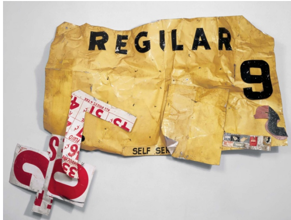
Robert Rauschenberg Regular Diary Glut , 1986 Assembled metal 85 x 116 x 24 inches (215.9 x 294.6 x 61 cm) Private collection

signs on the wall and the relationship to the oil in Texas at the time et cetera. He never stopped being a Port Arthur guy and southern Texas guy. Coastal Texas, I think is what he said.