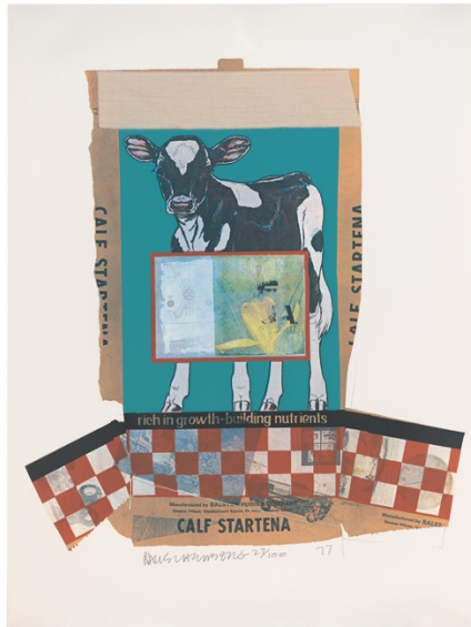
Robert Rauschenberg Calf Startena (Chow Bags) , 1977 Screenprint and collage on paper with plastic twine 48 x 36 1/4 inches (121.9 x 92.1 cm) From an edition of 100, published by Styria Studio, New York