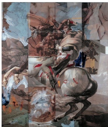
Robert Rauschenberg Able Was I Ere I Saw Elba I (Japanese Recreational Claywork) , 1983 Transfer on high-fired Japanese art ceramic 106 1/4 x 91 inches (269.9 x 231.1 cm) Otsuka Chemical Company, Japan

they could withstand anything but a baseball bat. You can put them outside, you can do anything, but the only thing you can't protect them from is a baseball bat. So the Napoleon used to hang out here in the back, between the front and the back, from the chapel and the whole thing. That was the decoration outside of his window, which they always thought was a rather dreary view, so they decided to spice it up by putting that out there. And that was it.