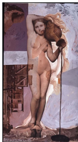
Robert Rauschenberg Drawing Room 4 (Japanese Recreational Claywork) , 1983 Transfer on high-fired Japanese art ceramic 65 3/8 x 33 1/6 x 2 1/2 inches (166.1 x 84 x 6.4 cm) Private collection

Q: So you talk about these memories from here. So given that we're doing this interview in this space—we're here at 381 Lafayette and of course it's the Foundation today; it's full of staff. I come down here to do my research. And so I'm curious about what your 381 Lafayette was. When Bob was here visiting, what this space was. You were here with him the second day of knowing Bob Rauschenberg. And so I'm curious actually if you could comment on this space, the people in it, the scene a little bit.