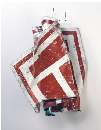
Robert Rauschenberg Tabasco Glut (Neapolitan) , 1987 Assembled metal 25 5/8 x 17 3/4 x 12 1/4 inches (65.1 x 45.1 x 31.1 cm) Private collection

Lahti: Well, his impact especially now is incredibly profound. I had a friendship with him and it wove into my life, it's altered my DNA and it's a completely different way of seeing—I see it over and over again with all the things I do. I went on to other things with performance and supporting performance and I can close with a little bit of that. But I can never explain why—and this is kind of another thing—where you would take a crumpled piece of metal that's red and white and has a T on it and you hang it on the wall, and it's one of the most exquisitely beautiful things you've ever seen. He could do that with everything.