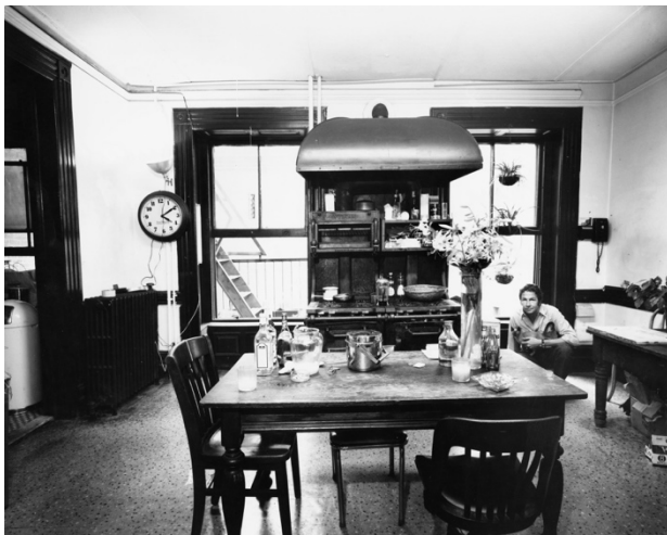
Rauschenberg in the kitchen of his Lafayette Street home and studio, New York, 1968. Photograph Collection. Robert Rauschenberg Foundation Archives, New York.