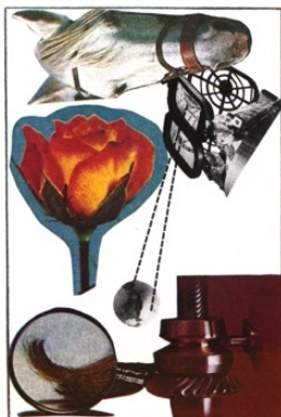
Robert Rauschenberg Untitled (for the San Francisco Heart Association), 1977 Lithograph 12 1/2 x 9 1/2 inches (31.8 x 24.1 cm) From an edition of 150 published by the San Francisco Heart Association, produced by Styria Studio, New York

Q: It seems he did these major series and then occasionally he would do one-offs there, like a poster for John Cage [ Wall to Wall John Cage + Friends , 1982]—