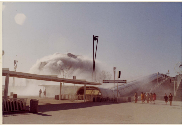
Pepsi Pavilion, Expo '70, Osaka, Japan, 1970. Pictured: Fujiko Nakaya's Fog Sculpture #47773 (1970).